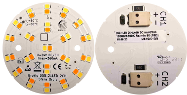
CM17129 BAMBOO LED modul - D55mm/6,5W/2CH LUXEON/180Ohm/ 1800K/6500K/Ra90