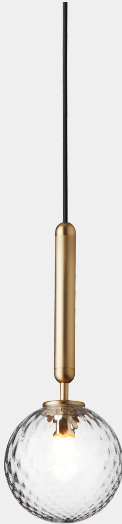
MIIRA 1 brass / optic clear