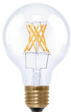
CM5565 Segula E27 LED filament 6W 500lm 220-240V