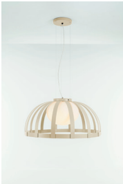
4025X Page 3