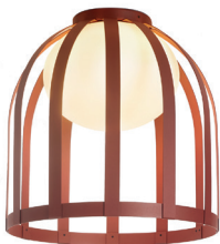
4022X Page 3