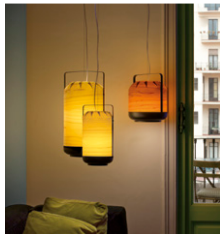
PHOTO: CHOU SMA, CHOU SPA, CHOU SPB Catalogue Pg. 90-97