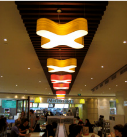
Catalogue Pg. 212-221